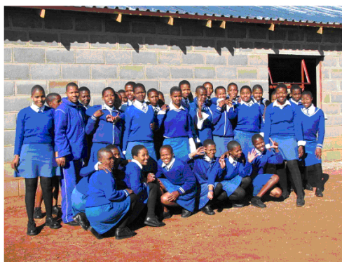
Girls standing in front of the new dormitory*