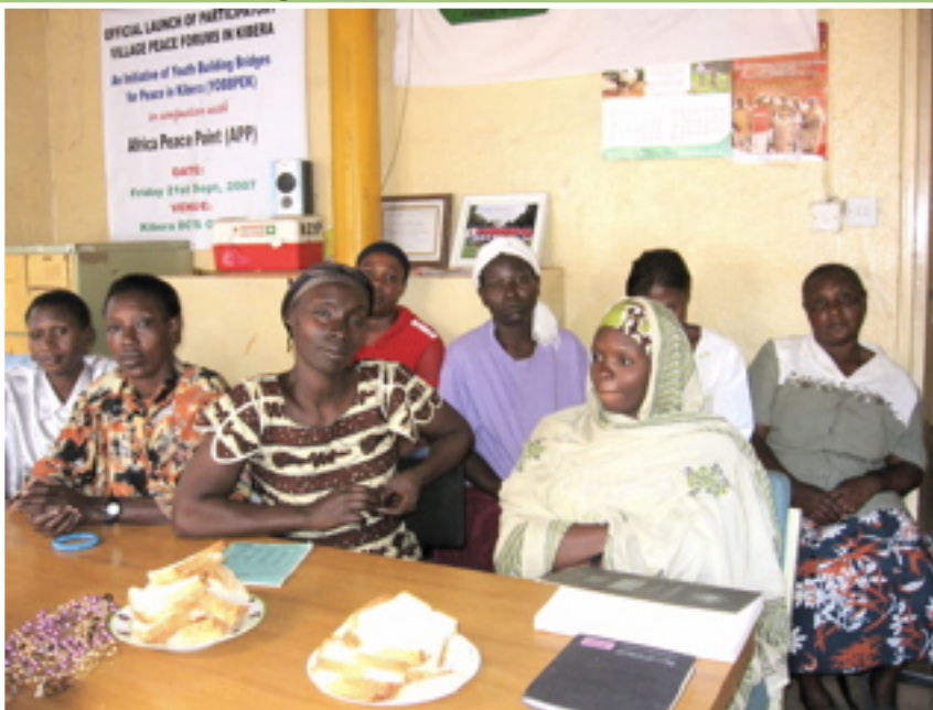
Women benefiting from the nutrition project in Kibera