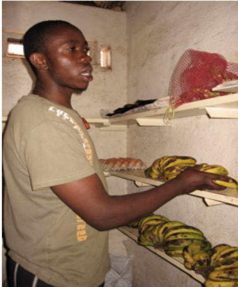
One of the youth group at the food shelf

We pondered. KCYP requested support to start providing nutritional food to the most impoverished PLWHA who are on ARVs. positively Africa sees this as a valued humanitarian project and