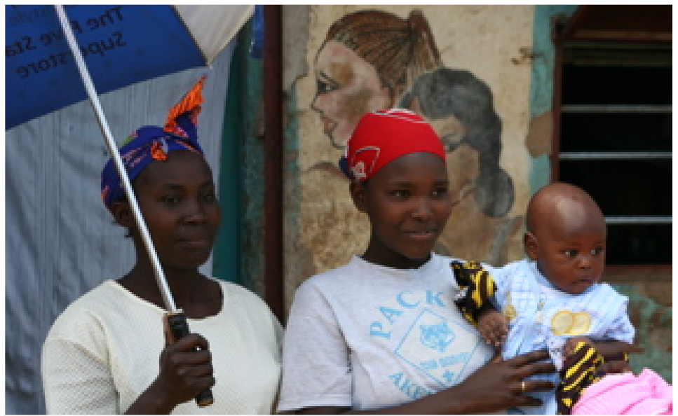
Kibera residents in nutrition project

The project was intended to serve the entire Kibera slum. However, after simple research and inquiries we realized that there are thousands of PLWHA in Kibera. We have narrowed our support to one